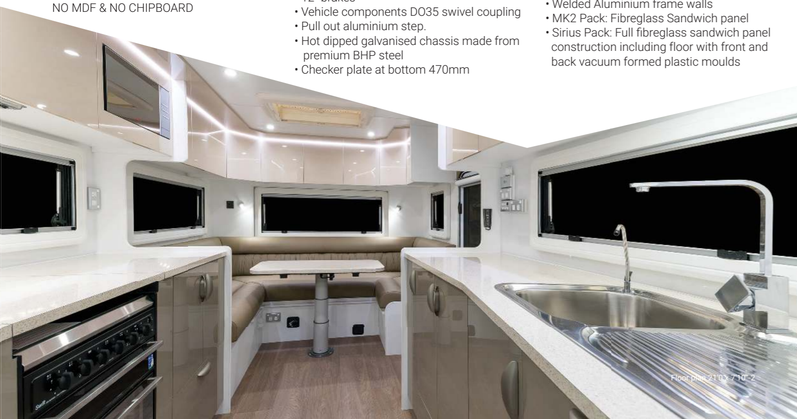
Floor plan 21'0" x 7'10"-2